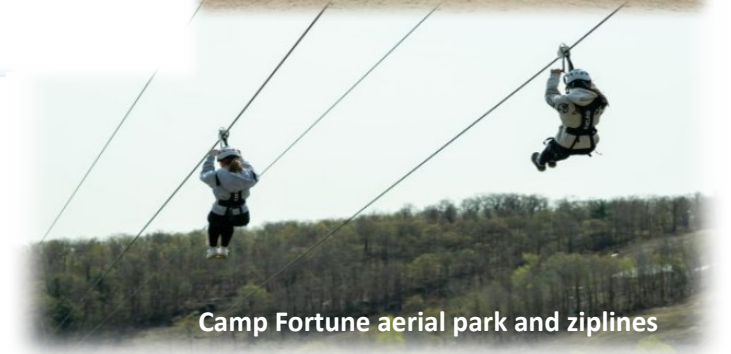
Camp Fortune aerial park and ziplines